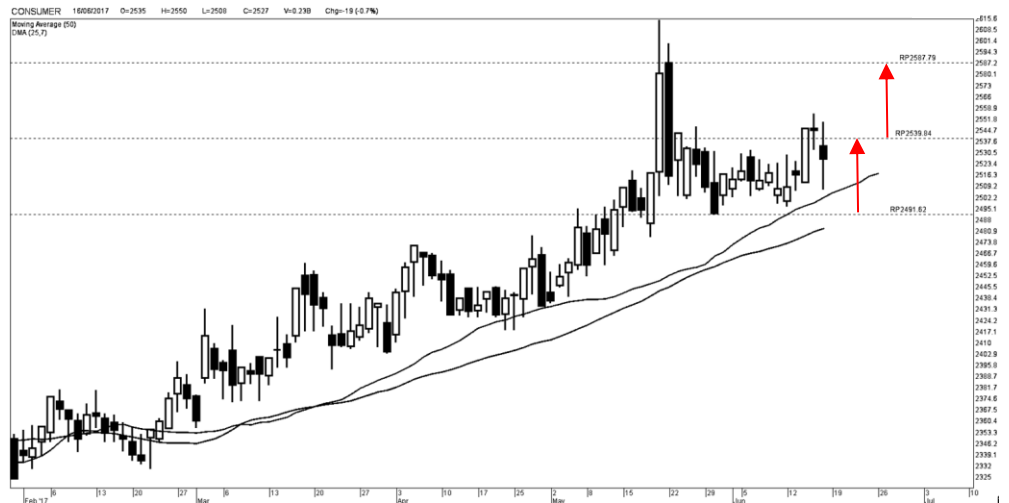
Kinerja sektor konsumer

Sementara potensi Pertumbuhan ICBP memiliki potensi Pertumbuhan tertinggi di bandingkan beberapa saham di sektor konsumer lainnya, antara lain MYOR, HSMP dan INDF